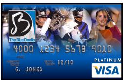
__ Card D