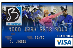
__ Card A