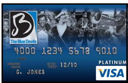
__ Card C