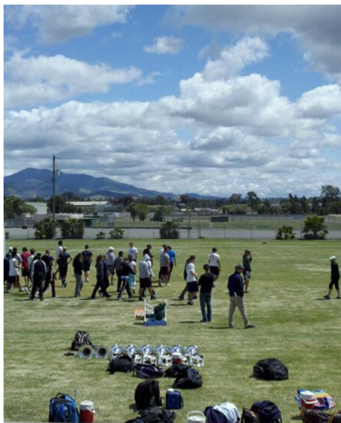
• Rehearsal at MARS