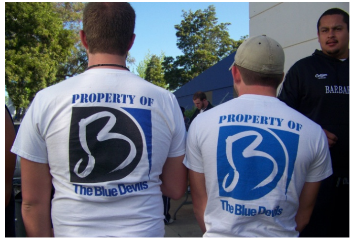
• The new version and the old version