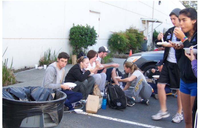
• Luxury is having a curb to sit on while eating