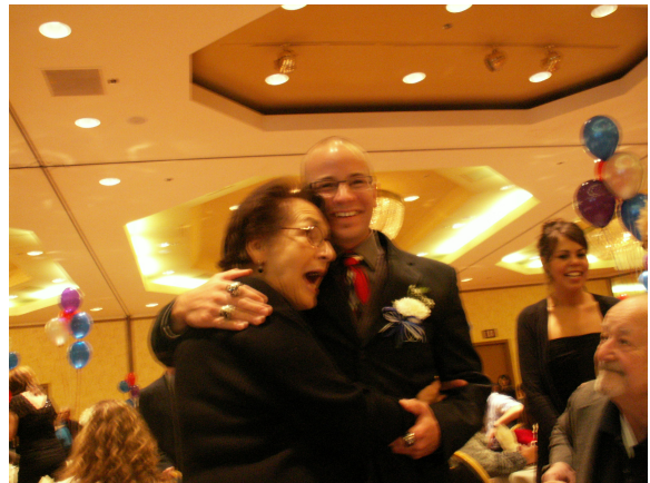
DM !! and Pres!!