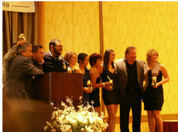
Percussion Performer(s) of the year – The whole Pit!!