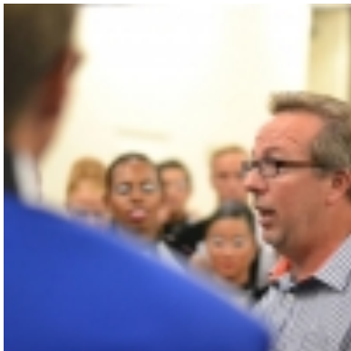
Yeah – You're Good!! --DG