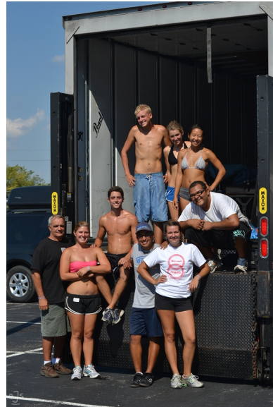
The Pit – Perfection In Tandem