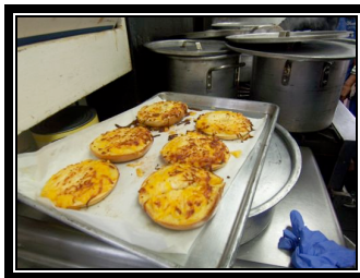
Famous Cheese Bagels