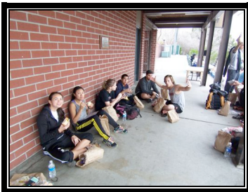
Sack Lunch at DVC