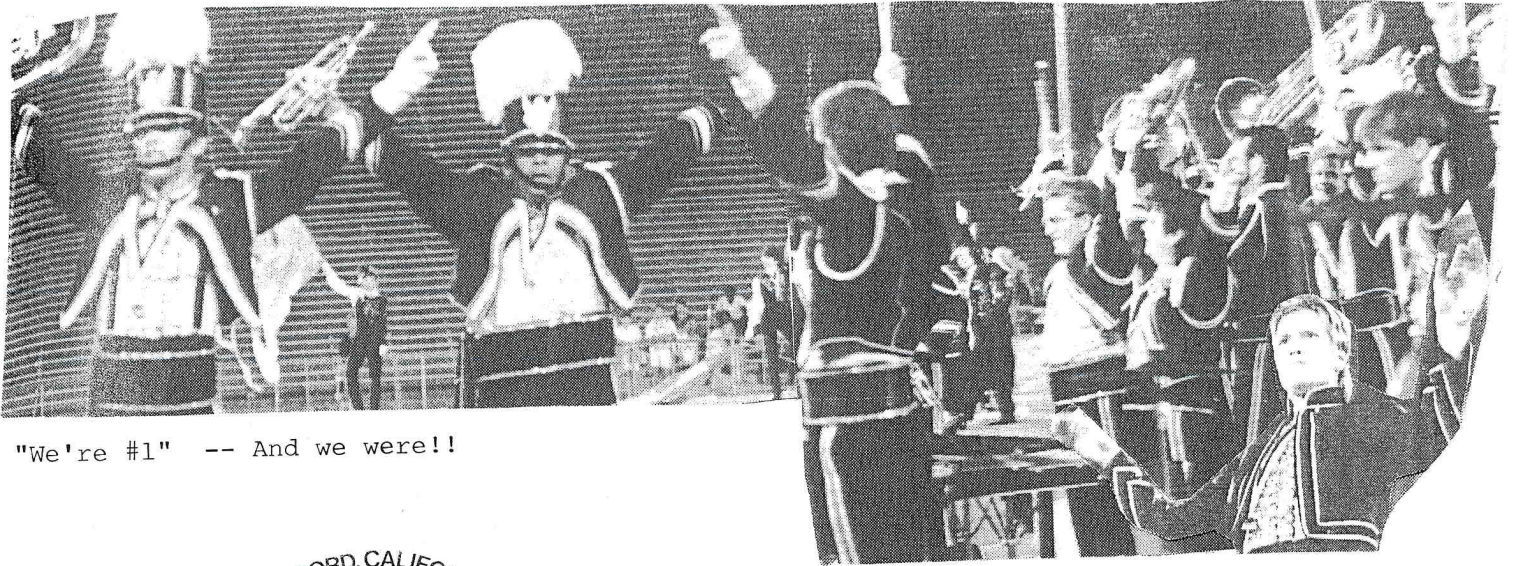
"We're #1" -- And we were!!