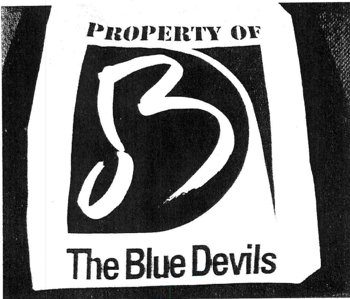
"Property of Blue Devils" T-Shirt for marching members only