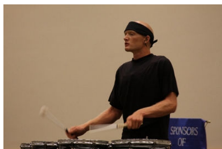
• I&E Champions