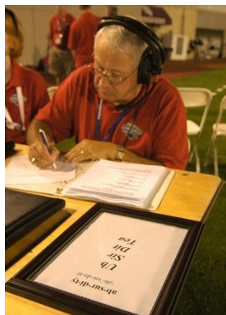
• Absurdity or Absurburdee ?