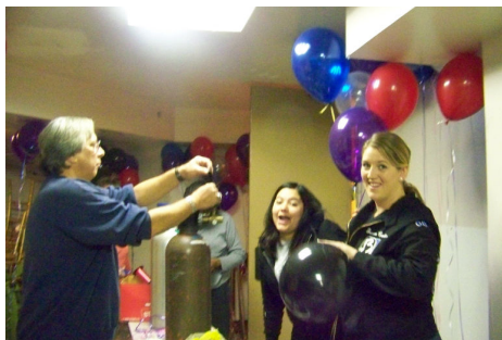
Balloons, balloons, balloons...

We will most likely be having our annual "Super Bowl" party. We haven't decided on a location as yet, but hope to have this finalized soon.