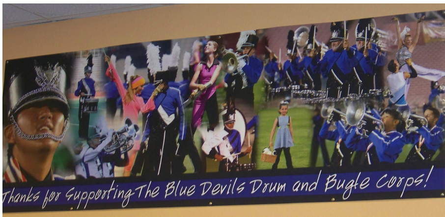
• Poster in our Bingo Hall

As soon as we have some information, we will make sure it is in the newsletter.