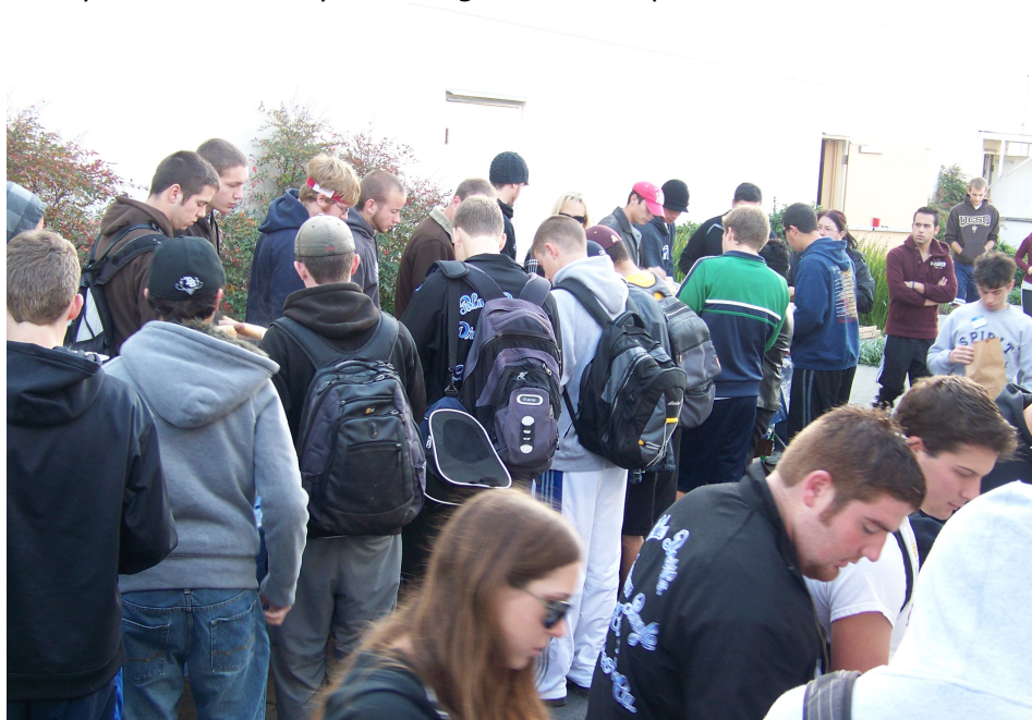
• A few of the attendees at breakfast

The color guard will not be with us until after the Winter Guard International (WGI) season is over. We understand the