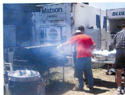
• We could sing "Smoke Gets In Your Eyes"