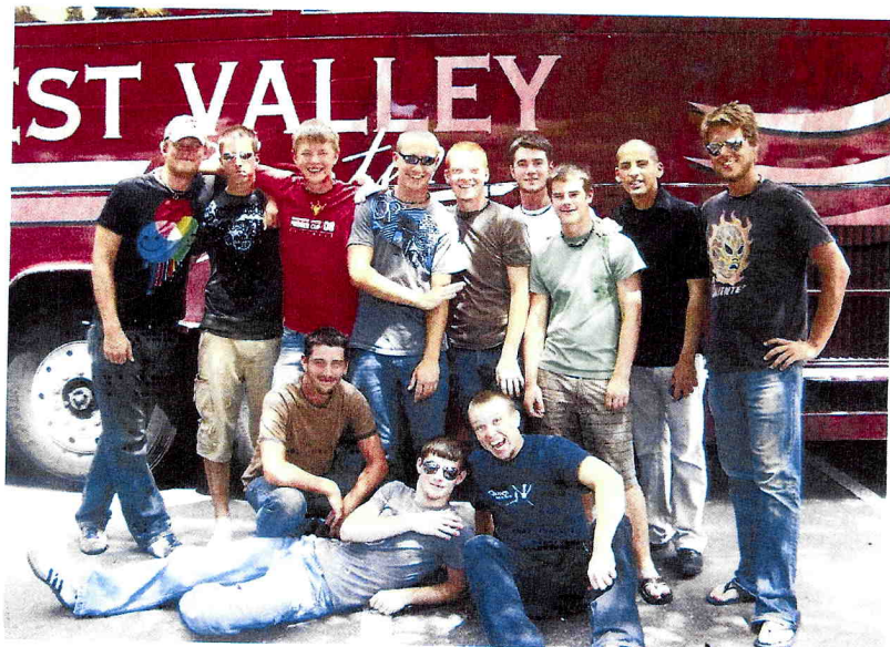
• A few "Hotel Williams" residents

goodbye after Finals. We don't like saying goodbye! However, we put a big smile on our faces, gave out lots of hugs, wished them all well (double checked to see if they forgot anything) and waved at the buses as they pulled out.