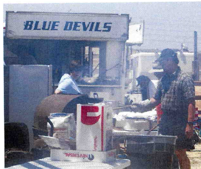
• Memorial Day "B" Corps cooks

Going into Stockton the weather hit 113 degrees and the show sponsors wisely delayed the show for an hour to help avoid some of the afternoon heat. Many members joked the Corps was just practicing for summer in Texas!!