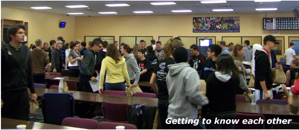
Getting to know each other