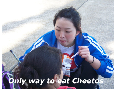
Only way to eat Cheetos

We did enjoy listening to the music and were a bit intrigued